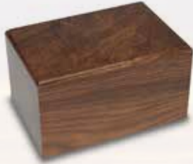
Suggested Urn (included in package price)

Don't add to your family's stress... let our staff handle the many details involved in planning a simple cremation without viewing or ceremonies including: