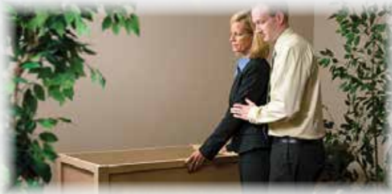
Viewing will be in container selected by family

An intimate viewing affirms the reality of a loss, allows healing to begin, and includes: