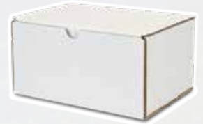
Temporary Cardboard (included in package price)

*** None of our packaged plans include the charges of other parties that may be involved such cemetery fees, church, clergy, musician, and vocalist honorariums, paid obituary charges of the newspaper, certified copies of the death certificate, and state sales tax, unless specified. ***